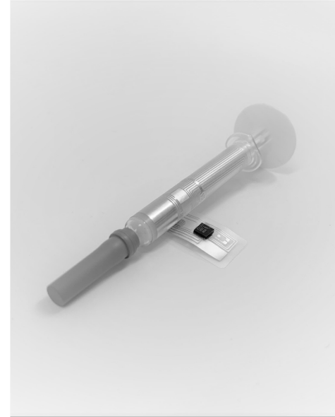
Identiv Smart Injectables