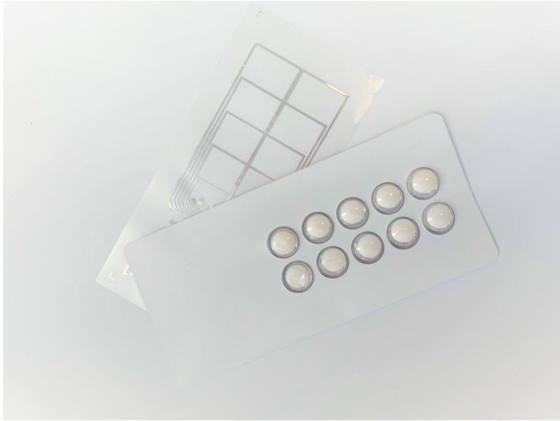
Identiv Smart Blister