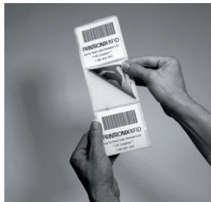
Figure 1 – Two views of a smart label.

Labels are printed using a thermal print process. A print head, embedded with a matrix of tiny heat elements that are precisely controlled, uses heat to transfer a wax or resin ink to the label. The ink is on a separate ribbon inside the printer. Smart labels come in rolls of various sizes which, along with the ribbon roll, are mounted inside the printer/encoder. An alternative to the label/ribbon system is direct thermal media, whereby chemicals in the label turn black when headed by the print head.