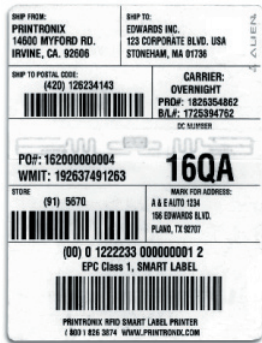
Figure 2 – Typical format for case labeling.

Application requirement – Tag readability is a major factor. A complete product packaging study (also called a case analysis) is required to ensure tag readability. Case analysis should include a comprehensive assessment of package contents, packaging design, label placement and the package labeling process. Package contents and packaging design may affect tag readability, particularly if metals, liquids, high carbon or salt content is involved. This affects label placement on the package, and package orientation with respect to readers as it moves through the process. Storage and handling requirements determine whether you need such things as freezer-grade adhesive, or polyester rather than paper label material to withstand heat.