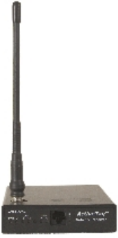
ActiveTag AT-132-NR- IP Receiver

The system uses sentry posts, middleware and applications from Emergent combined with RFID tags, readers, and TCP/IP networking connections from Axxess, an RFID and video solutions provider based in Carrollton, Texas. Each sentry post houses a tag reader (the ActiveTag AT-132-NR-IP Receiver), a tag activator (the ActiveTag AT-132 Activator) that wakes the tag up so that it can communicate to the reader, a power supply and a TCP/IP connection that integrates with an Emergent database or Integra database from Systech.