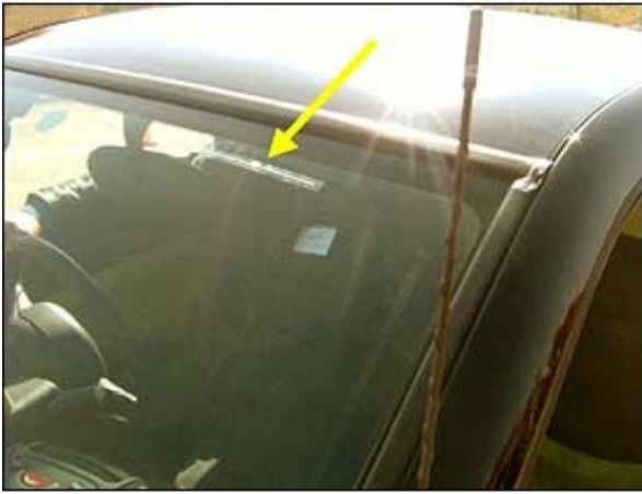
DaimlerChrysler Smart car with ENP tag

iPico's new UHF ENP technology uses the company's existing EM4222 passive chip design already used for supply chain management and tire-tagging applications. For its ENP system, however, the company redesigned the tag so it could be attached to the inside of a vehicle's windshield and developed readers for roadside placement.