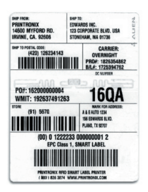
Figure 2 – Typical format for case labeling.

Application requirement – Tag readability is a major factor. A complete product packaging study (also called a case analysis) is required to ensure tag readability. Case analysis should include a comprehensive assessment of package contents, packaging design, label placement and the package labeling process. Package contents and packaging design may affect tag readability, particularly if metals, liquids, high carbon or salt content is involved. This affects label placement on the package, and package orientation with respect to readers as it moves through the process. Storage and handling requirements determine whether you need such things as freezer-grade adhesive, or polyester rather than paper label material to withstand heat.